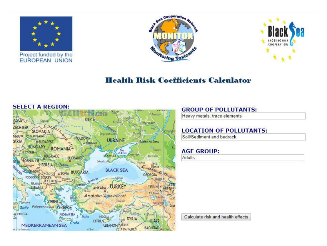
Fig. 1. Health risk calculator version 1.0

In order to create the application (Fig. 1), we used a series of indices existing in the literature and measured or historical data.